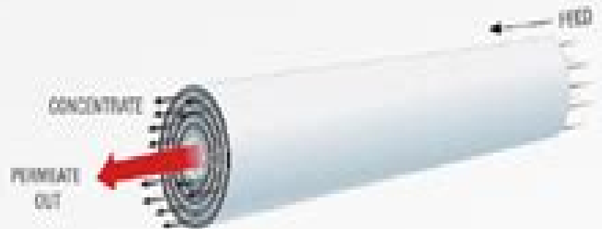
4 Finished spiral element