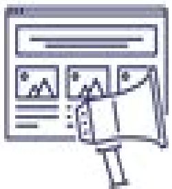
Transparency and legitimacy