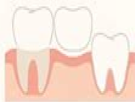
Dental Crowns and Bridges