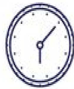
Limitation of storage term