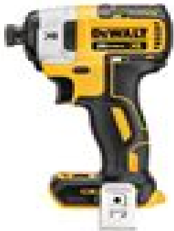
Cordless impact driver