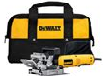
cordless biscuit joiner