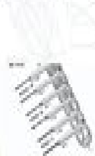
3 phase AC produced in a power station

Three phase alternating current (AC) is made up of three sine waves that are 120 degrees out of phase with each other. This means that when one phase is at a peak, the other two are at a trough. This is how three phase AC is produced in a power station.