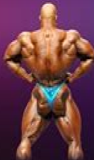
POSE #6: BACK LAT SPREAD POSE