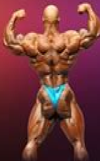
POSE #5: BACK DOUBLE BICEP POSE