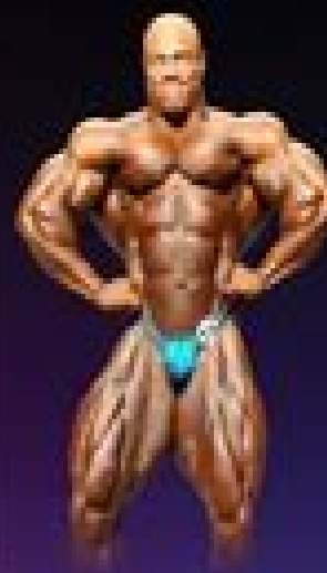
POSE #2: FRONT LAT SPREAD POSE