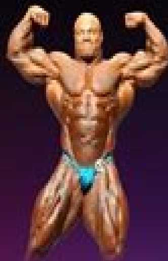
POSE #1: FRONT DOUBLE BICEP POSE