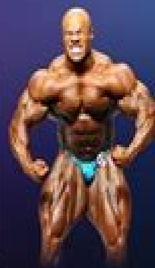
POSE #8: MOST MUSCULAR POSE