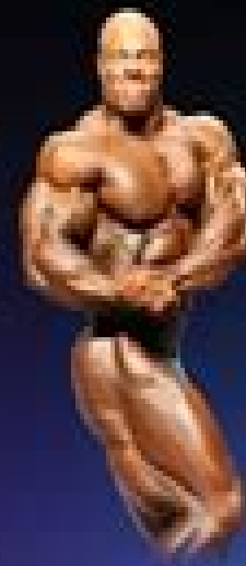
POSE #3: SIDE CHEST POSE