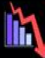
Ineffective Resource Allocation