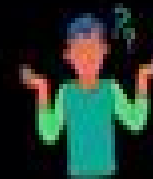
Resistance to Adopting Technology