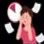
Poor Student Data Management