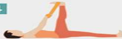
RECLINING HAND TO BIG TOE