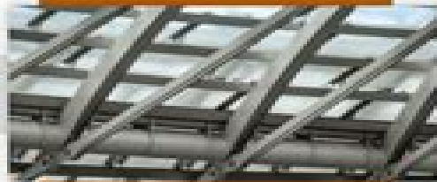
Make Use of New Technologies

Move forward with your project by looking backward at previous experts