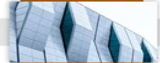
Flip the Script

The Neenan Company is committed to excellence and will help you craft an amazing new building