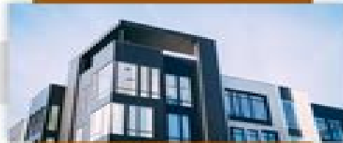
Have Some Flair