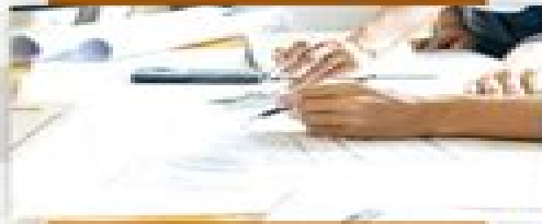
Commit to Problem Solving