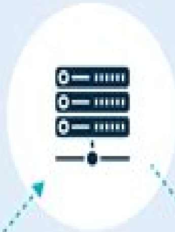
Telematics System Servers