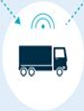
Tracking Device (Inside Vehicle)