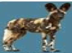
African Hunting Dog