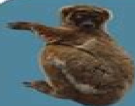
Eastern Woolly Lemur