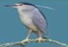
Black-crowned Night Heron