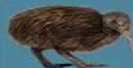
North Island Brown Kiwi