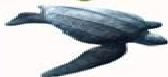
Leatherback Sea Turtle