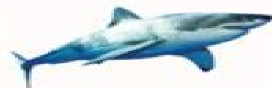
Great White Shark