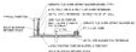
SHOWER PAN DETAIL - 2ND FLOOR