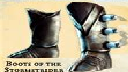
BOOTS OF THE STORMSTRIDER