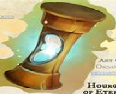
HOURLASS OF ETERNITY