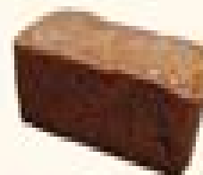
Malt loaf (Barley bread)