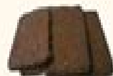
Pumpernickel (Rye bread)