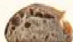
San Francisco Bread (Sourdough bread)