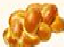
Challah (Leavened bread)