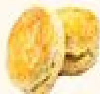
Scone (Quick bread)