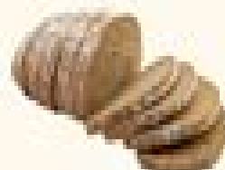
Brown bread (Whole wheat bread)