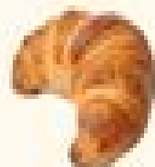
Croissant (Buttered bread)