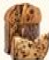
Panettone (Sweet bread)