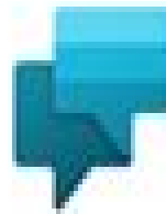
Power Virtual Agents Intelligent Virtual Agents