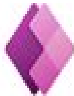
Power Apps App Development