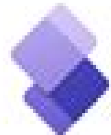
Power Pages External-facing website