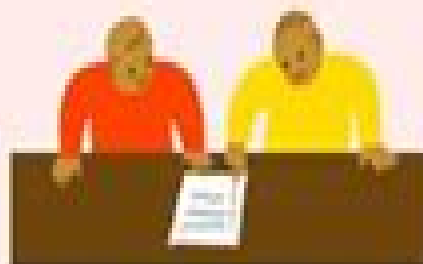
4. Following directions