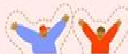
5. Respecting personal space