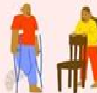
7. Using manners